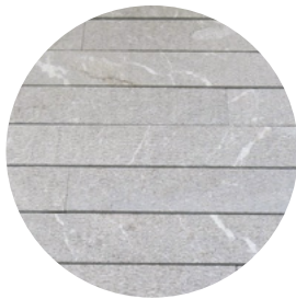
Sancerre (Hand Chiseled)